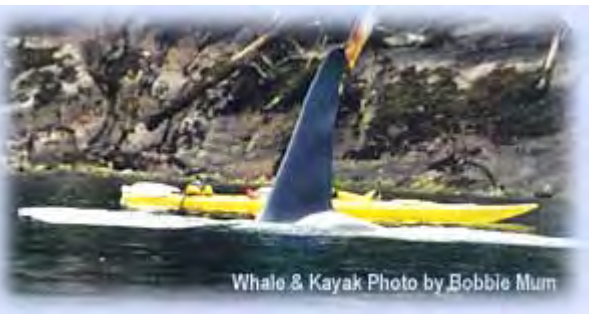
Whale & Kayak

Take a 14 passenger, 32 foot, custom built water taxi from Lowell Point and watch for sea otters, whales, sea lions and eagles. This paddle is one of our Kayak Guides Favorite half day paddles. The water taxi takes you to the eastern remote side of Resurrection Bay and lands in Humpy Cove. There, you will paddle around Orca Island area, and into magical rock gardens teeming with marine wildlife in them... lots of starfish... and other wildlife too! Kayakers will paddle to a salmon stream area, where there is a beautiful waterfall area cascading down pillow basalt formations that are absolutely gorgeous.... Starfish are everywhere... this calm cove is a beautiful emerald green and commonly seen here are sea lions, sea otters, mountain goats, and sometimes orca and humpback whales. Bald Eagles are common. From Orca Island and Humpy Cove we travel south to Kayaker's Cove, where we wait in a comfortable wilderness lodge/hostel for the water taxi to take us back to beautiful Lowell Point.